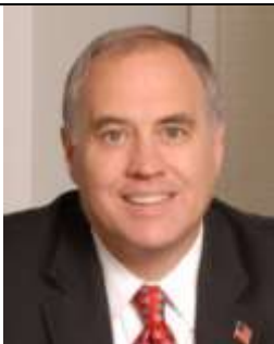
Next week's speaker: New York State Controller Tom DiNapoli ( http://www.youtube.com/watch?v=8FbQtqAw3fo )

Paul Harris would have been 140 years old next Saturday, April 19. At the R.I. convention in 1922, held in Los Angeles, our name was changed from the "International Association of Rotary Clubs" to "Rotary International." Paul Harris sent a message to the convention by "wireless."